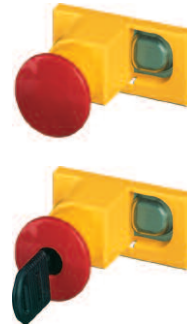
Emergency-Stop twist or key to release, red on yellow background