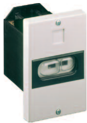
Flush Mounting Enclosure IP55 with integrated PE(N) terminal