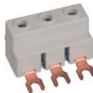
Power Feed Block