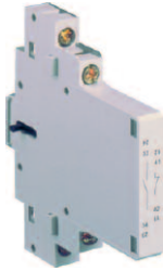
Auxiliary contact blocks for side mounting (3.5A/230VAC; 2A/400V AC)