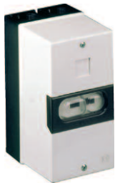
Insulated Enclosure IP55 with integrated PE(N) terminal; top and bottom each have 2 metric knock-outs