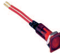
Indicator Light with neon bulb, nominal rated voltage: 220 - 240V or 380 - 440V